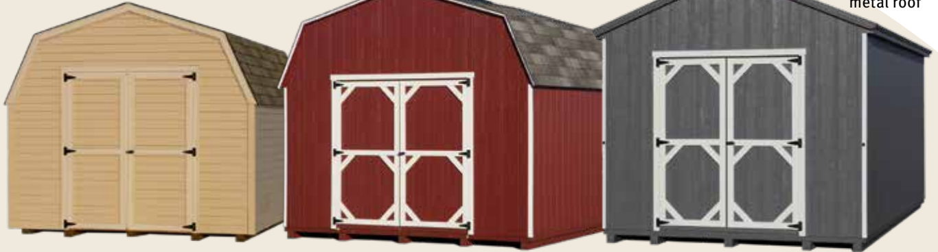
Grey with white trim 10' x 16' • Charcoal gray standard metal roof