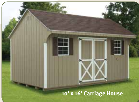
10' x 16' Carriage House

One 5' x 6' double door Two 21" x 27" windows with screens & shutters. (6' x 8' - 8' x 10' only one window.)