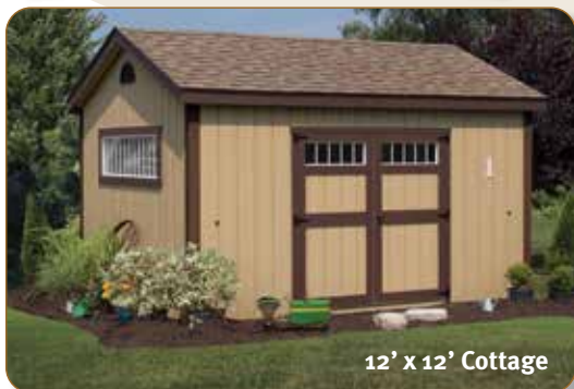
12' x 12' Cottage