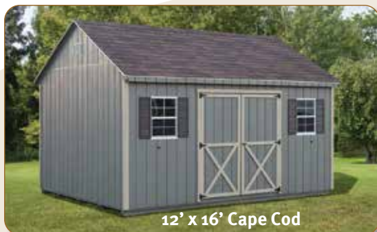
12' x 16' Cape Cod