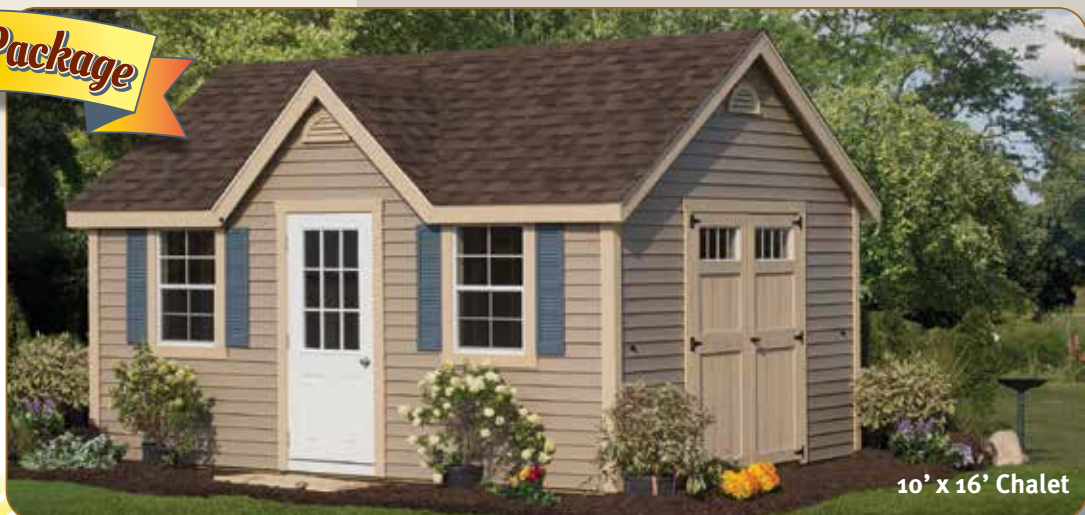
10' x 16' Chalet

Colors shown: Vintage Wicker, Stolzhus Almond trim