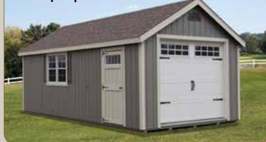
12' x 24' Cape Cod

Colors shown: Clay, Stolzhus Almond trim