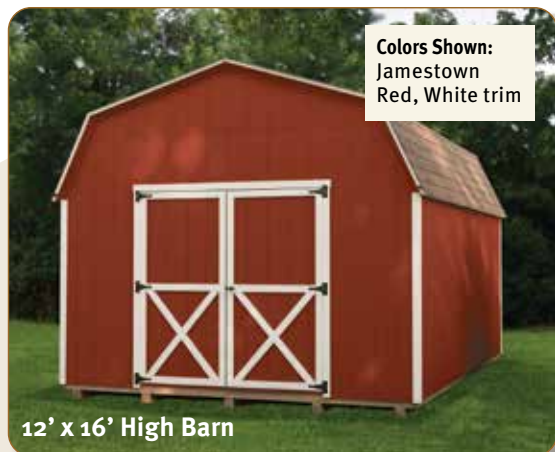
Colors Shown: Jamestown Red, White trim

Premium Series CUSTOM BUILT HIGH QUALITY