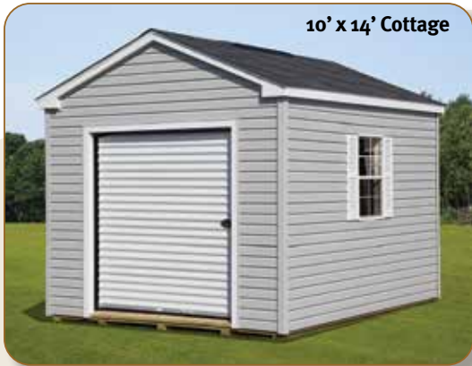
10' x 14' Cottage

Premium Series CUSTOM BUILT HIGH QUALITY