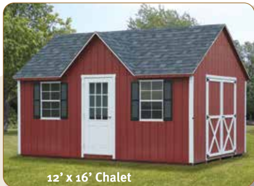
12' x 16' Chalet

Premium Series CUSTOM BUILT HIGH QUALITY