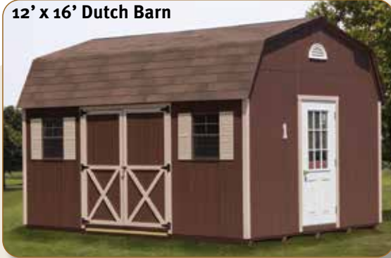
12' x 16' Dutch Barn

6' X 6' double door 6'6" Side walls, 10' tall 2 - 21" x 27" Windows with screens and shutters