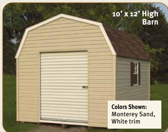
10' x 12' High Barn