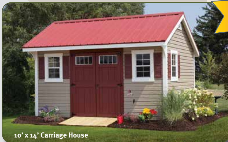
10' x 14' Carriage House

Options shown above: Deluxe trim package Colors shown: Mahogany Stain, Black trim