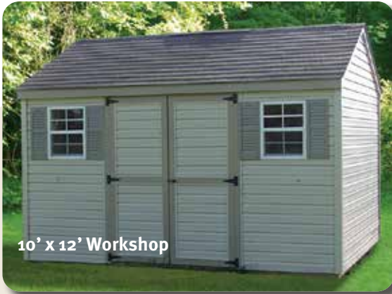
10' x 12' Workshop

Premium Series CUSTOM BUILT HIGH QUALITY