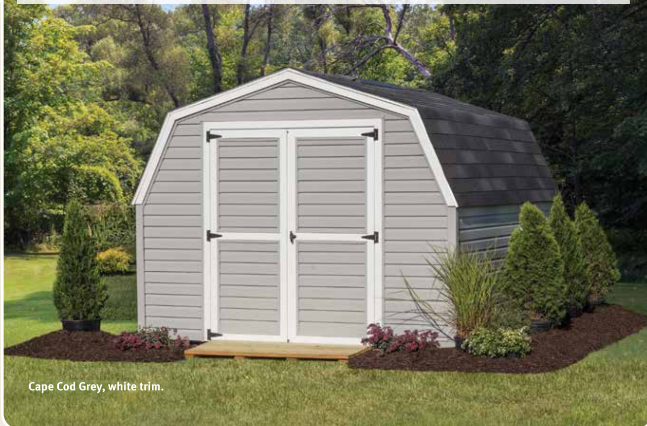
Cape Cod Grey, white trim.

Pro Series! Pro Series buildings are an affordable alternative to costly monthly fees at the storage rental units. In stock and affordable solution to your storage needs.