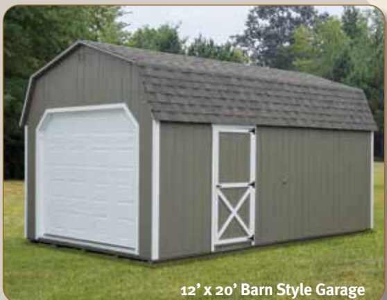
12' x 20' Barn Style Garage

36" Solid prehung door, 30" x 36" window