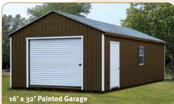
16' x 32' Painted Garage