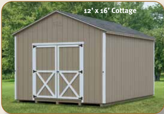
12' x 16' Cottage