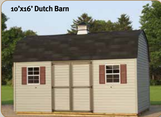
10'x16' Dutch Barn

Double Door Two windows, 21" x 27" with screens and shutters, 6'6" wall height.