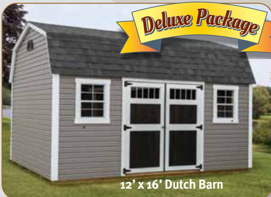
12' x 16' Dutch Barn