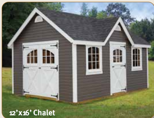
12' x 16' Chalet