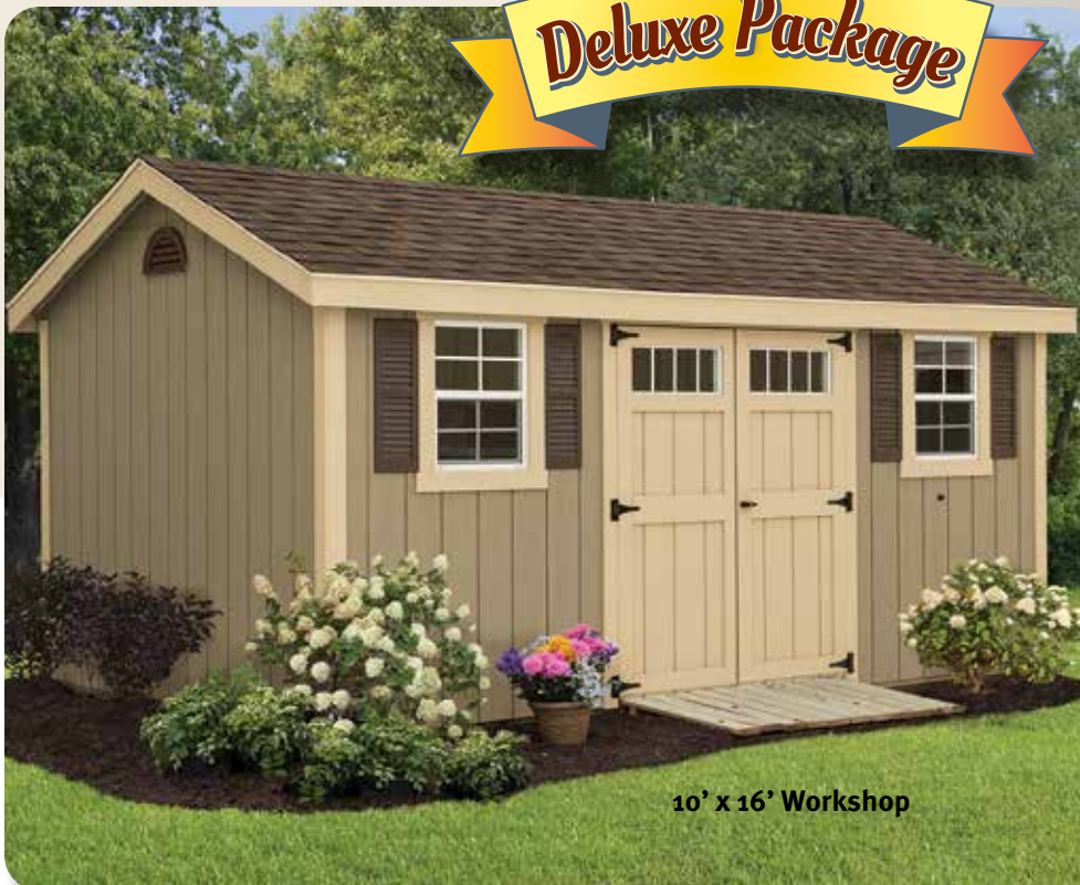
10' x 16' Workshop

6'6" sidewall 5 X 6 Double door Two-tone Paint Two 21" x 27" windows with screens and shutters.